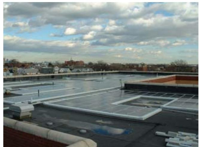
Figure 1. Rooftop PV array on Bayonne, NJ high school